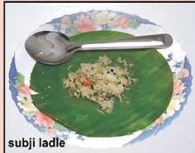
RICE : FRIED / PULAO (VEGETABLE)